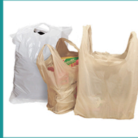
Grocery and Retail Bags

Only plastic bags and film labeled with #2 or #4 (polyethylene) resin ID are accepted.