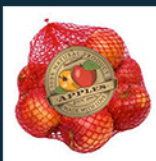
X Net or Mesh Produce Bags