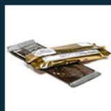
X Candy Wrappers