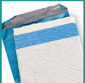
Plastic Only Shipping Envelopes & Bubble Mailers