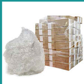
Pallet Wrap and Stretch Film