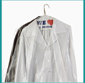
Dry Cleaning Bags