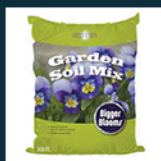
X Mulch or Soil Bags