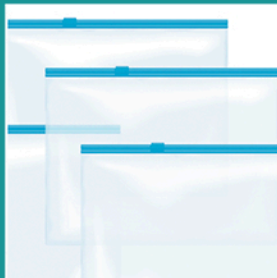
Resealable Food Storage Bags