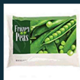
X Frozen Food Bags

No bags, film, or wrap labeled with #1 (PET), #3 (PVC), #5 (PP), #6 (PS) or #7 (Other).