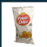
X Chip Bags